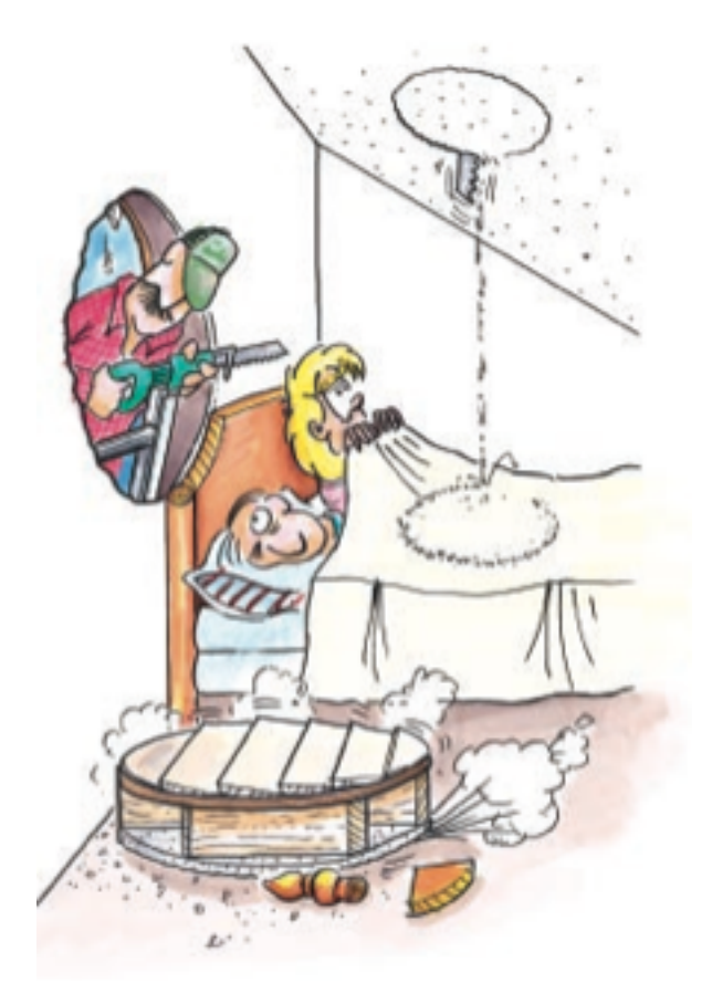
Respect the customers' routines

planning to do, and note everything you plan to do that a cheaper competitor may not bother with.